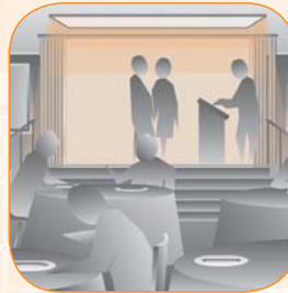
Restaurants and cafes

CR-6/9 N Remote control included with the product, to control up to 5 units of the same model in series.